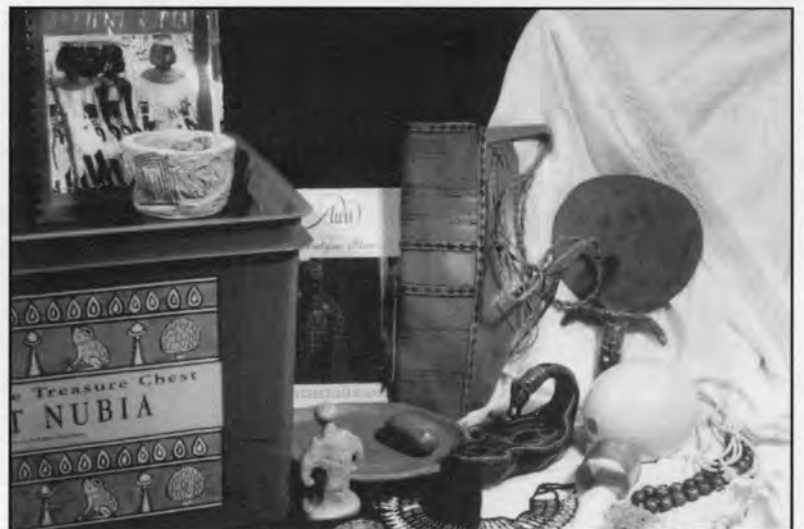
Treasure chests containing replicas of artifacts, costumes, books, and background information for teachers were developed as part of the Oriental Institute Museum/Chicago Public Schools Collaboration

gramming, both at the museum and in the classroom. The project has produced a broad range of curriculum materials based on the Institute's artifact and archival resources. Its Classroom Visitor program has brought graduate student archaeologists, historians, and linguists into the public schools to show children how the Institute learns about the ancient past. Oriental Institute and community artists are visiting classrooms to involve students in ancient art processes, supplementing the dwindling arts programming in the city's schools. The final goal of the project involves the Oriental Institute's newest resource — teachers have joined with Museum Education staff to determine ways our World-Wide Web site can be integrated into the Chicago Public Schools curriculum.