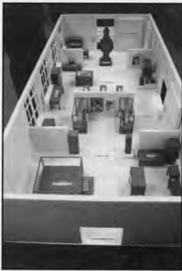
A preliminary design for the reinstallation of the Egyptian Gallery