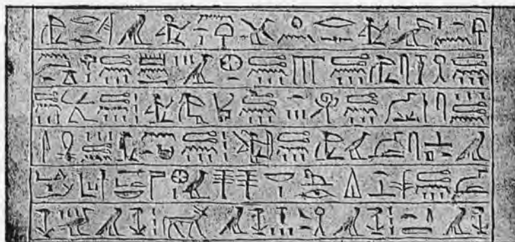
Portion of the Stela of Sobekhotep (Tübingen Nr. 458) from Hieroglyphische Chrestomathie , plate 11, by Hellmut Brunner (Wiesbaden, 1965)

The long-range goal of this project is to enable universities to employ technology in innovative ways to rethink the relationship between student and teacher, the difference between classroom learning and distance learning, and the differences between self-paced instruction and instruction that follows the academic calendar. The goal is to create a new paradigm for language instruction, one that can be adapted to a variety of languages in the future.