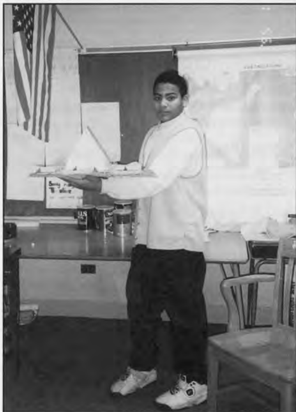
A student from Sheridan School proudly displays his model of the Great Pyramid at Giza during the "Ancient Egypt Fair" presented by his class

The Illinois Association of Museums (IAM) has presented the Oriental Institute Museum with a Superior Achievement Award for the Oriental Institute Museum/Chicago Public Schools Collaboration for the World History Curriculum, a ground-breaking partnership program between the Museum Education Department and 22 underserved Chicago Public Elementary Schools. This award, the highest honor the IAM can give, recognizes the partnership's achievements in creating a comprehensive outreach program to enrich the study of ancient civilizations in 6th and 7th grade classrooms throughout the city of Chicago. Funded by two major grants from the Polk Bros. Foundation, this project began in 1993. Over the past four years it has provided seminars on the ancient Near East for close to 70 teachers, and it has involved more than 6,000 students in extensive enrichment pro-